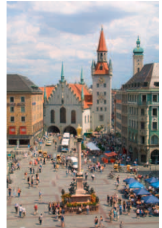
Marienplatz, Altes Rathaus

The old town is bordered by the mountains Kapuzinerberg, Mönchsberg and Festungsberg. The latter is crowned by the Hohensalzburg fortress, the landmark of Salzburg which was built in 1077. One day excursion.