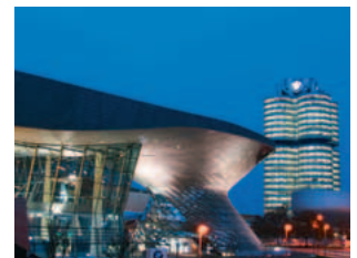
BMW Welt und BMW Museum

Since 2007 automobile enthusiasts have had a new place to go to in Munich: the BMW Welt Munich. Next to the Olympic Park and the BMW Museum, it stands out in the shape of a double-cone and offers visitors the chance to experience the BMW brand with all their senses. Even complex developments are presented here on two levels in a simple way that everyone can understand. Half-day excursion.